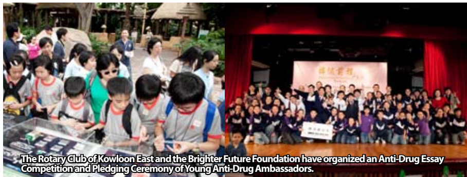
The Rotary Club of Kowloon East and the Brighter Future Foundation have organized an Anti-Drug Essay Competition and Pledging Ceremony of Young Anti-Drug Ambassadors.