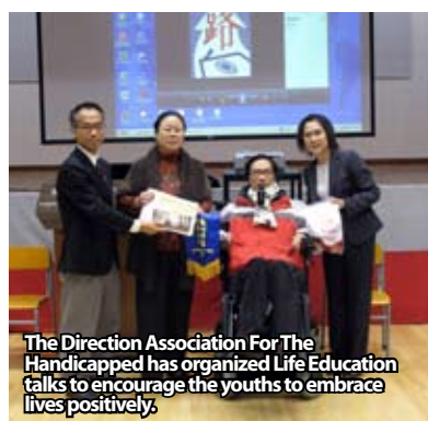
The Direction Association For The Handicapped has organized Life Education talks to encourage the youths to embrace lives positively.

Supported by the Action Committee Against Narcotics and the Narcotics Division, Security Bureau 禁毒常務委員會及保安局禁毒處全力支持