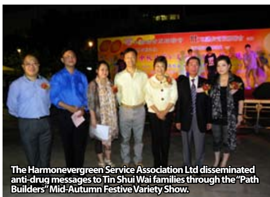
The Harmonevergreen Service Association Ltd disseminated anti-drug messages to Tin Shui Wai families through the "Path Builders" Mid-Autumn Festive Variety Show.