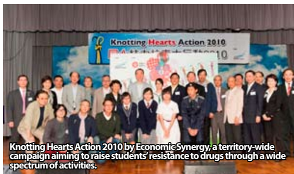
Knotting Hearts Action 2010 by Economic Synergy, a territory-wide campaign aiming to raise students' resistance to drugs through a wide spectrum of activities.