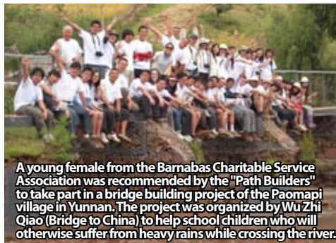
A young female from the Barnabas Charitable Service Association was recommended by the "Path Builders" to take part in a bridge building project of the Paomapi village in Yunnan. The project was organized by Wu Zhi Qiao (Bridge to China) to help school children who will otherwise suffer from heavy rains while crossing the river.

The Green Island Cement Company Limited has organized a staff seminar themed "Path Builders · Healthy Drug-free Family" enhance the staff's knowledge towards harmful effects of drug abuse.