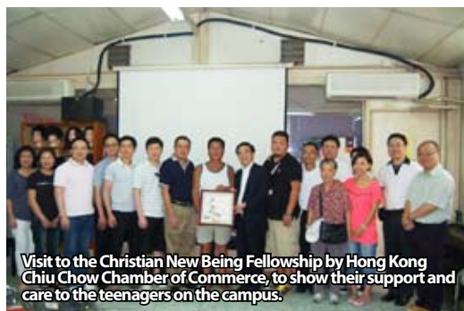
Visit to the Christian New Being Fellowship by Hong Kong Chiu Chow Chamber of Commerce, to show their support and care to the teenagers on the campus.