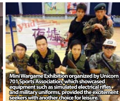
Mini Wargame Exhibition organized by Unicorn 701 Sports Association, which showcased equipment such as simulated electrical rifles and military uniforms, provided the excitement seekers with another choice for leisure.