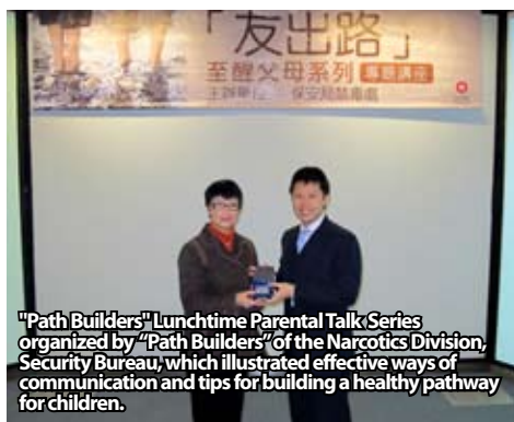
"Path Builders" Lunchtime Parental Talk Series organized by "Path Builders" of the Narcotics Division, Security Bureau, which illustrated effective ways of communication and tips for building a healthy pathway for children.

Email: pathbuilders@sb.gov.hk Website: www.pathbuilders.gov.hk Enquiry: 2867 5976 / 2867 2766