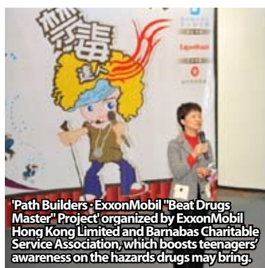
"Path Builders: ExxonMobil "Beat Drugs Master" Project" organized by ExxonMobil Hong Kong Limited and Barnabas Charitable Service Association, which boosts teenagers' awareness on the hazards drugs may bring.