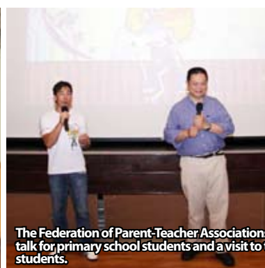
The Federation of Parent-Teacher Associations of Yau, Tsim and Mongkok Districts has organized an anti-drug talk for primary school students and a visit to the Customs and Excise Training School for secondary school students.