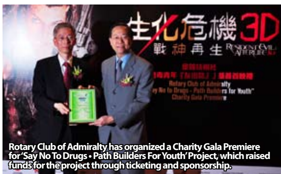
Rotary Club of Admiralty has organized a Charity Gala Premiere for 'Say No To Drugs - Path Builders For Youth' Project, which raised funds for the project through ticketing and sponsorship.