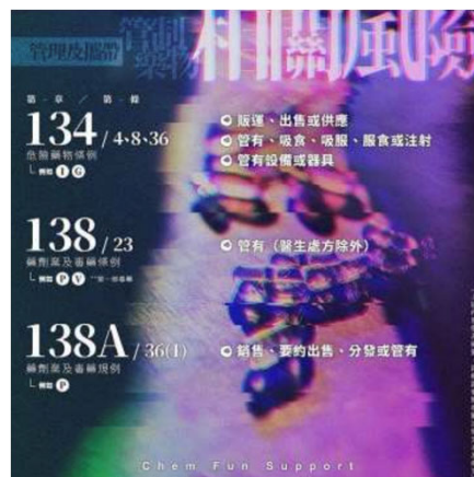
Drug prevention video and posters production