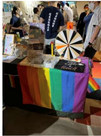
LGBT event outreach