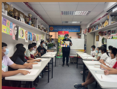
Art Class in HKNF