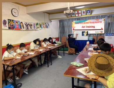
Art Class in Kirat Yakthung Chumlung Him, Jordan