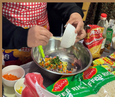
Nepali snack chatpate