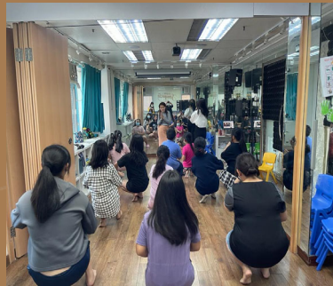
Dance Class in Samyukta Dance Studio