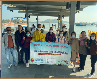
Operation Dawn Island HK