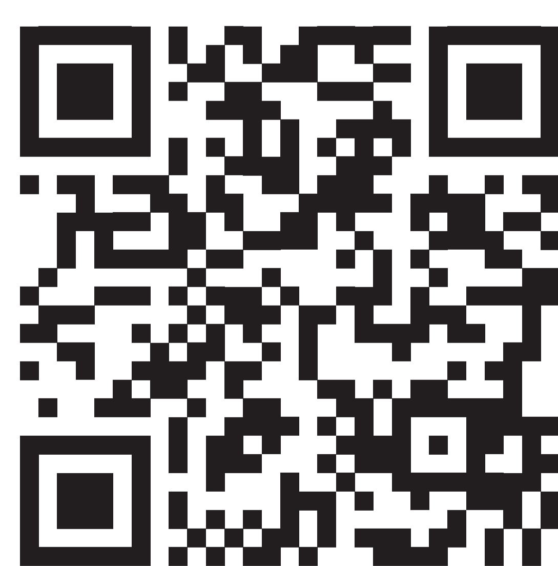
Narcotics Division, Security Bureau Website