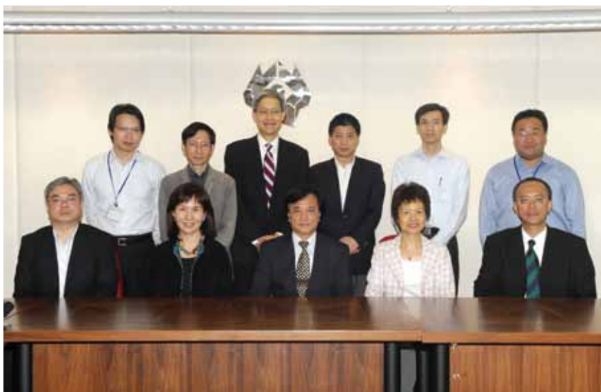
研究諮詢小組(二〇〇九至二〇一一年) Research Advisory Group (2009 – 2011)