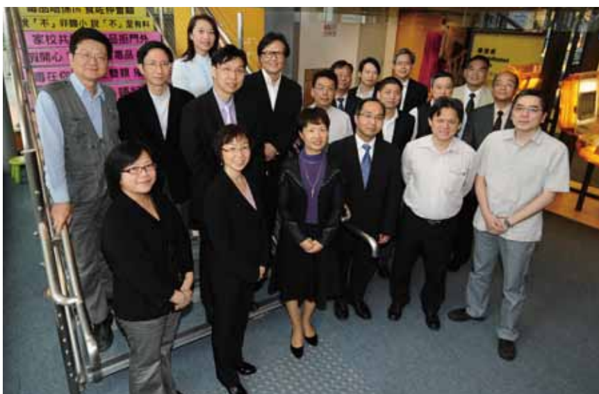
禁毒常務委員會戒毒治療及康復小組委員會（二〇〇九至二〇一〇年） ACAN Sub-committee on Treatment and Rehabilitation (2009 - 2010)