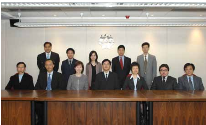
研究諮詢小組(二〇〇七至二〇〇九年) Research Advisory Group (2007 – 2009)