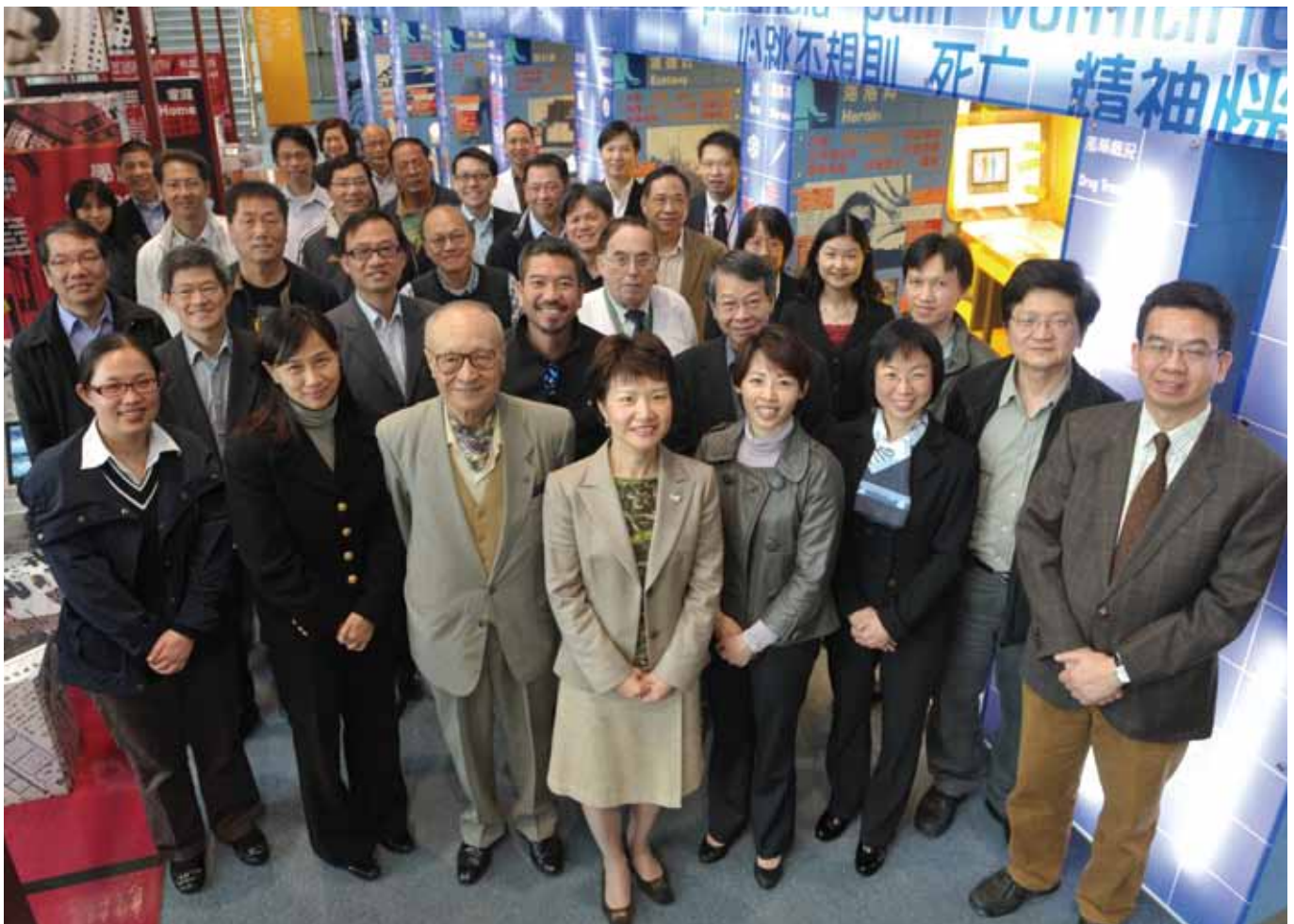
毒品問題聯絡委員會 Drug Liaison Committee

The Committee comprises representatives of non-governmental organisations (NGOs), drug education experts and government representatives. It serves as a useful platform for the exchange of views between the Government and NGOs on a wide range of drug-related matters in general, and drug treatment and rehabilitation issues in particular.