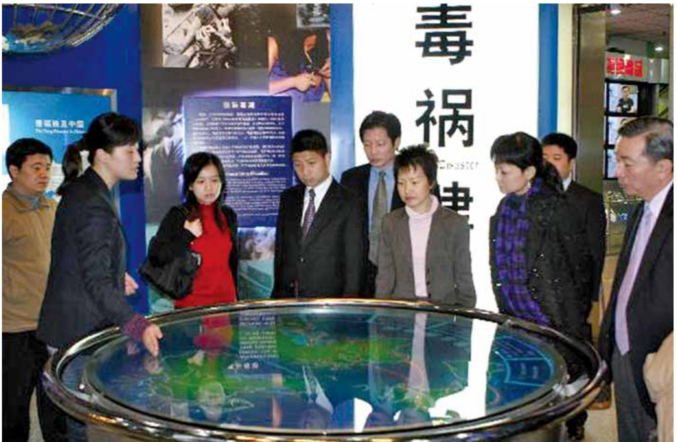
禁毒處及禁毒常務委員會代表團參觀上海市禁毒教育館。 Delegates from the ND and the ACAN visit an anti-drug education centre in Shanghai.

On the research front, the Research Advisory Group oversees the research studies commissioned in response to changing drug abuse trends. The membership composition is reviewed and changed flexibly to meet the research needs.