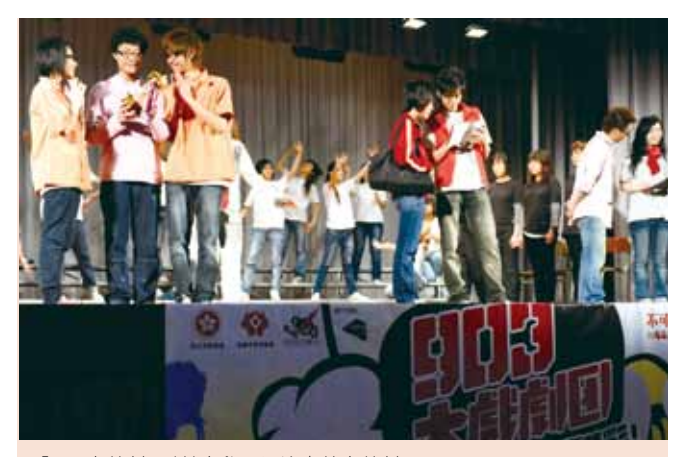
「903大戲劇團」於中學巡迴演出禁毒戲劇。 Drama performance by the "903 Drama Tour" conducted in secondary schools to disseminate anti-drug messages.

二〇〇八年,兩項大型計劃先後推出,包括與商業電台和一個專業劇團合辦的戲劇訓練和製作計劃,以及與政府青少年一站式網站和香港電台合辦的禁毒短片比賽,以加深青少年對吸毒遺害的了解。