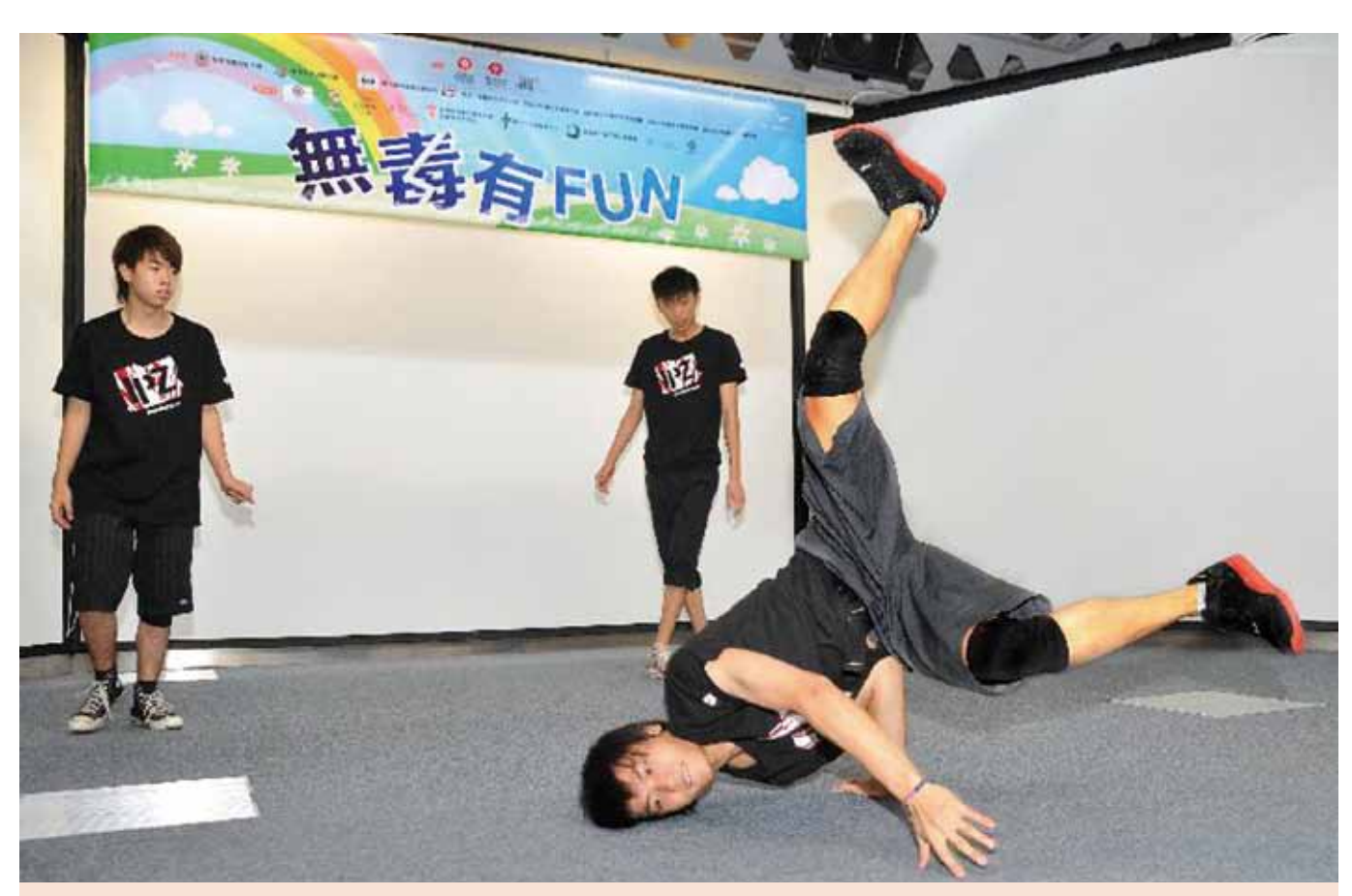
基督教香港信義會北區青少年外展社會工作隊的青少年在香港賽馬會藥物資訊天地「無毒有Fun 2010」活動表演街頭舞蹈。 Hip-hop dance performance by youths from the North District Youth Outreaching Team of Evangelical Lutheran Church Hong Kong at the DIC Fun Day 2010.

A number of anti-drug thematic exhibitions were held to share with public anti-drug messages and stories of rehabilitated drug abusers.