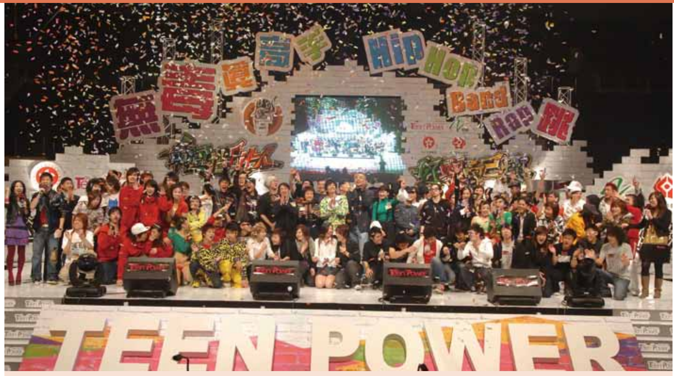
二〇〇八年「無毒真高手 Hip Hop Band Rap跳」音樂和舞蹈比賽的嘉賓和得獎者於閉幕大匯演合照。 Group photo of guests and winners attending the finale of "No Drugs Hip Hop Dance and Music Competition" held in 2008.