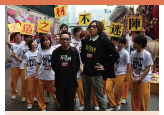
二人樂隊組合農夫在二〇〇九年全港青少年禁毒運動主題曲發布會上與「天比高無處不在朋咤咤」禁毒舞蹈團團員合照。 Popular music duo FAMA and the Skyhigh anti-drug dance squad at

Popular music duo FAMA and the Skyhigh anti-drug dance squad at an event to release the theme song of the Territory-wide Campaign Against Youth Drug Abuse 2009.