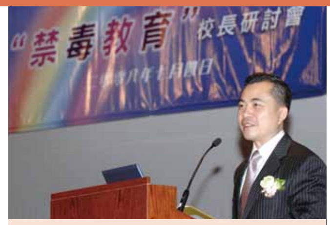
律政司司長黃仁龍資深大律師出席禁毒教育校長研討會,與五百 多名中、小學校長及教育界人士一起為打擊青少年毒品問題共謀 對策。

The Secretary for Justice, Mr Wong Yan Lung, SC, speaks at an anti-drug seminar for school heads to map out strategies to fight against youth drug abuse. More than 500 school principals and educators from primary and secondary schools attended the seminar.