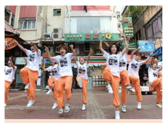
「天比高無處不在朋咤咤」禁毒舞蹈團團員表演街頭舞。 Members of the Skyhigh anti-drug dance squad performing street dance.

當局又與香港電台合作,於二〇一〇年推出一系列以一般及高危青少年和家長為對象的禁毒活動。有關活動包括禁毒廣播劇、禁毒講座、訓練營、禁毒流行曲創作比賽、電台廣播節目及禁毒家庭日營。