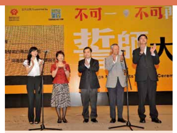
二〇〇九年舉行的「不可一、不可再」誓師大會。 "No Drugs No Regrets" pledge ceremony in 2009.

二〇九年,禁毒運動以新主題「天造之材 不進迷陣」繼續推行。「不可一、不可再」誓師大會及「同行抗毒大會」分別於二〇〇九及二〇一〇年舉行,讓致力禁毒工作各方聚首一堂,重申對打擊毒禍的承諾。禁毒處及禁毒常務委員會以是項運動為基礎,於二〇一〇年七月推出新一輪禁毒運動,題為「企硬!唔take嘢」,進一步鞏固年青人遠離毒品的決心。為配合這項運動,當局使用了年輕一代的語言,製作了三套電視宣傳短片及電台宣傳聲帶和新海報。針對年紀較小的學童吸食咳藥水和吸入劑有上升之勢,當局於二〇一〇年製作了另一套針對兒童為對象,以這些毒品的禍害為題的電視宣傳短片及電台宣傳聲帶和海報。